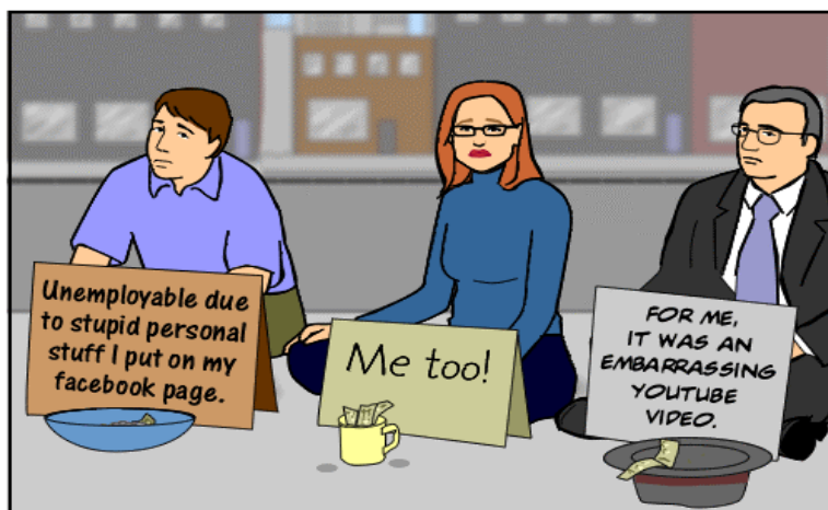
Signs of the social networking times.