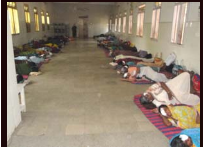
Patients waiting for their operations