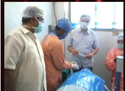
Rotarians assisting in the procedures